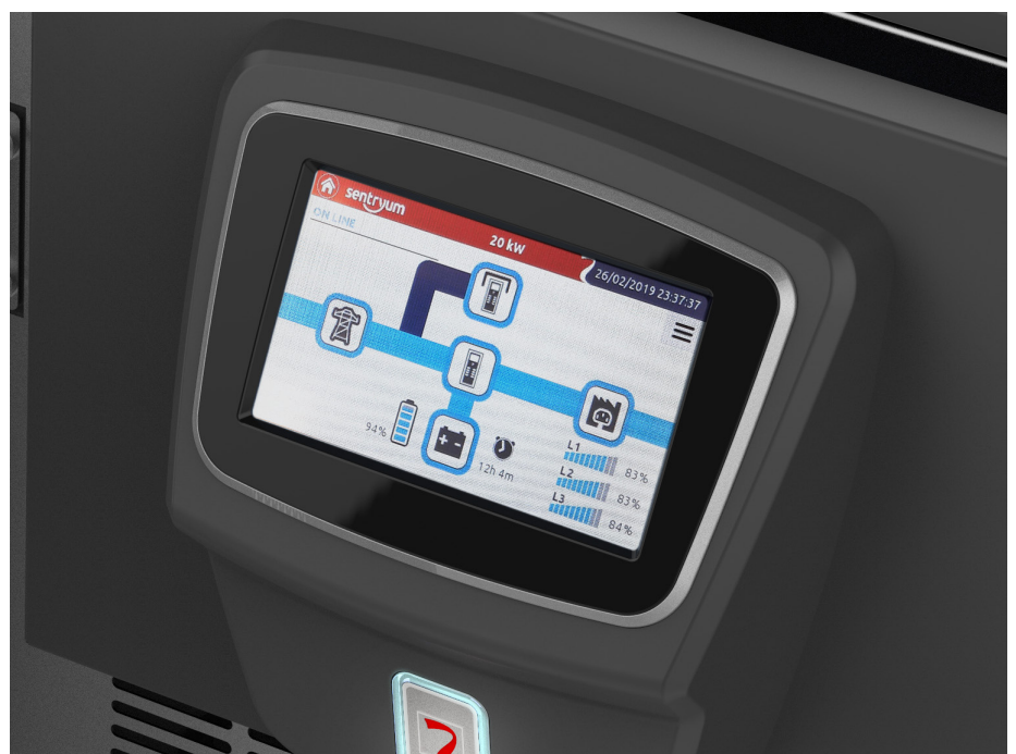
Graphic touch screen display

Wide voltage range: the rectifier is designed to operate within a wide input voltage range (up to -40% at half load), reducing the need for battery discharge and thus helping to extend battery life.